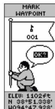
Mark Waypoint Page